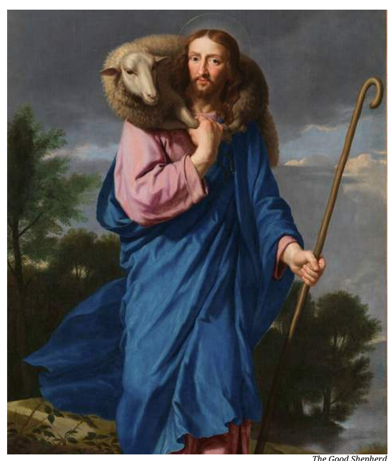
The Good Shepherd Philippe de Champaigne

M-W & Friday - 5:00 - 6:00 P.M. Holy Hour, Thursday - 5:30 - 6:30 P.M.