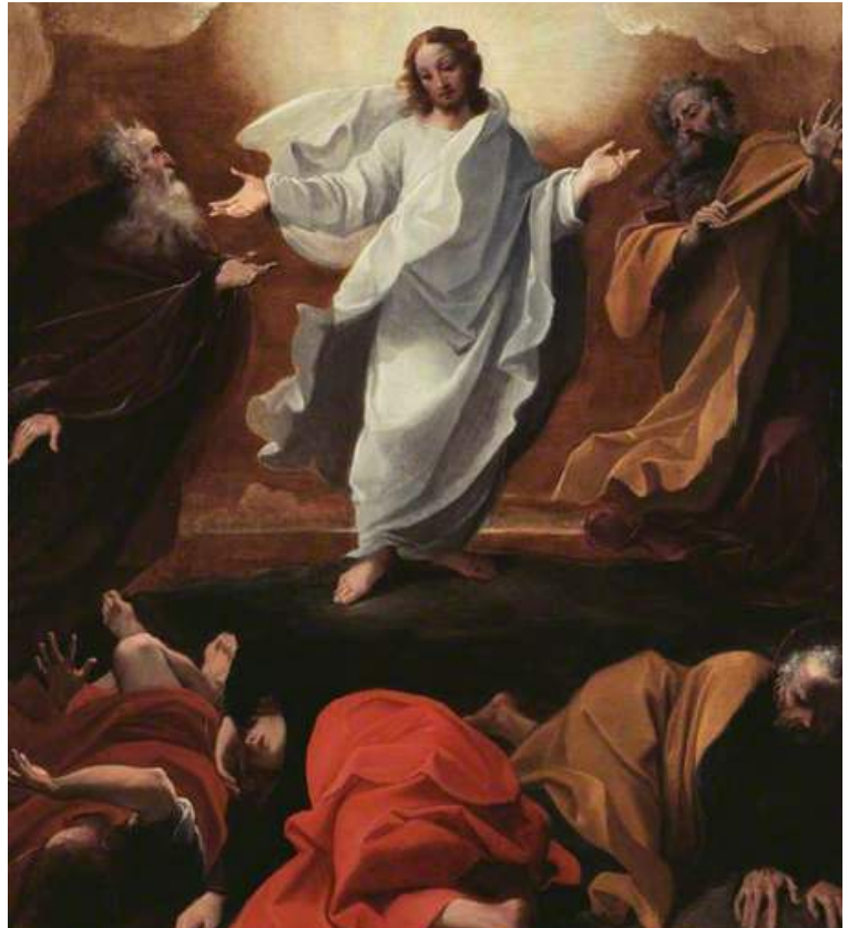
The Transfiguration Ludovico Carracci