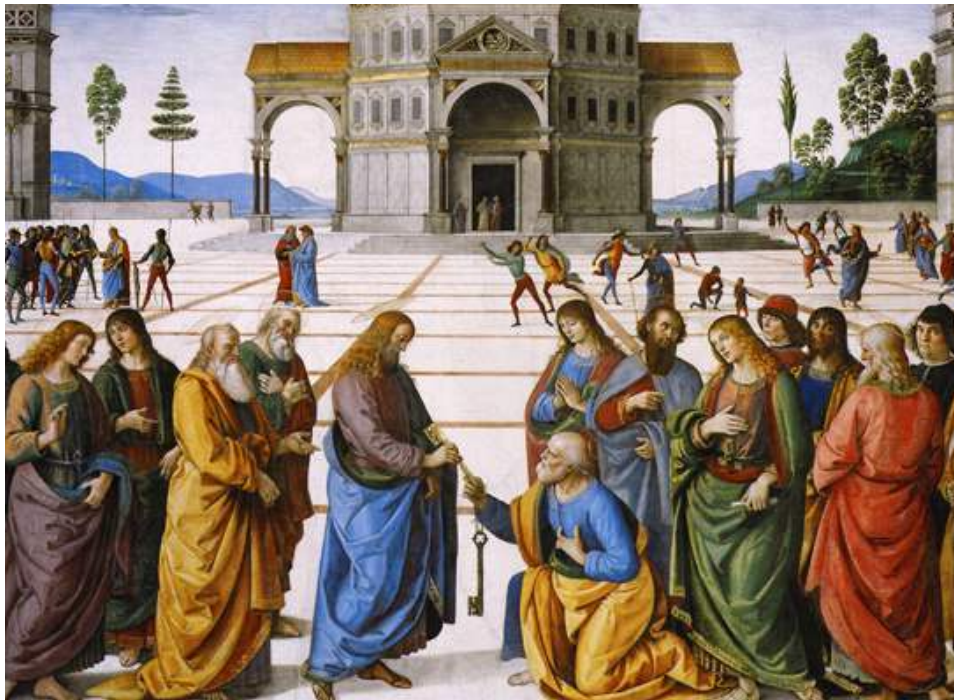
Christ Handing the Keys to St. Peter Pietro Perugino