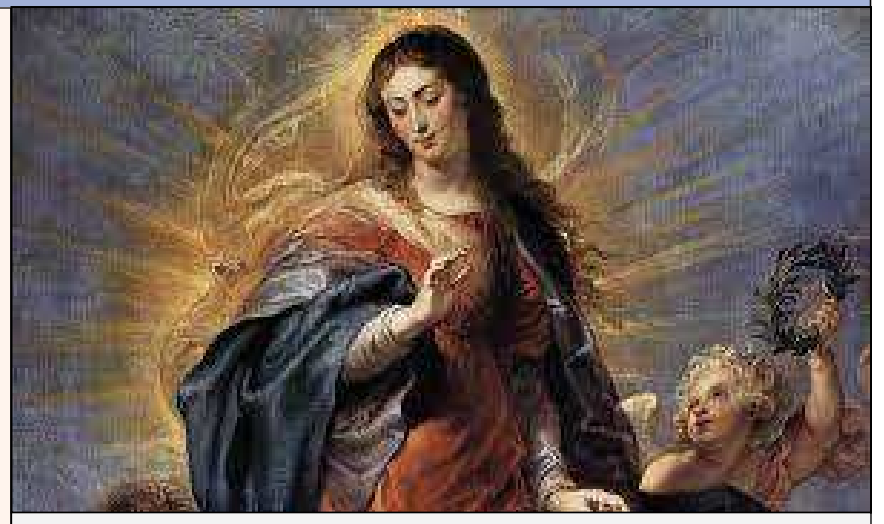
December 8 The Solemnity of the Immaculate Conception

FINANCE COUNCIL Financecouncil@loyoladenver.org